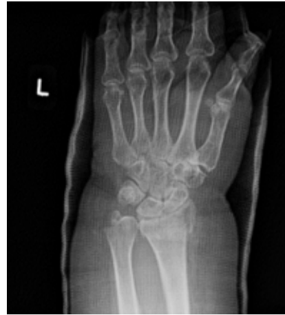
After 2 weeks cast