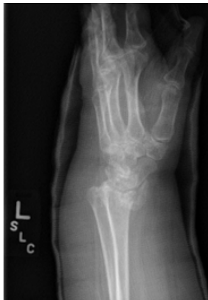
After 4 weeks cast - lateral view