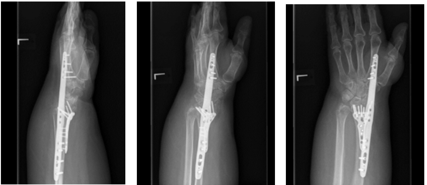
Postoperative X-rays : 6 weeks after surgery

The postoperative protocol included immediate Occupational Therapy for the patient's fingers and wrist to promote pronation and supination. The patient came back for her 6-weeks consultation and the X-rays showed improving healing at the distal radius metaphysis. The patient was taken to the Operating Room for hardware removal through the minimally invasive incisions, and also for a gentle manipulation under anesthesia to alleviate some of the stiffness at the radiocarpal, midcarpal and distal radioulnar joints.