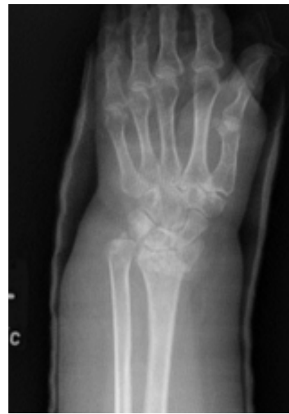
After 4 weeks cast