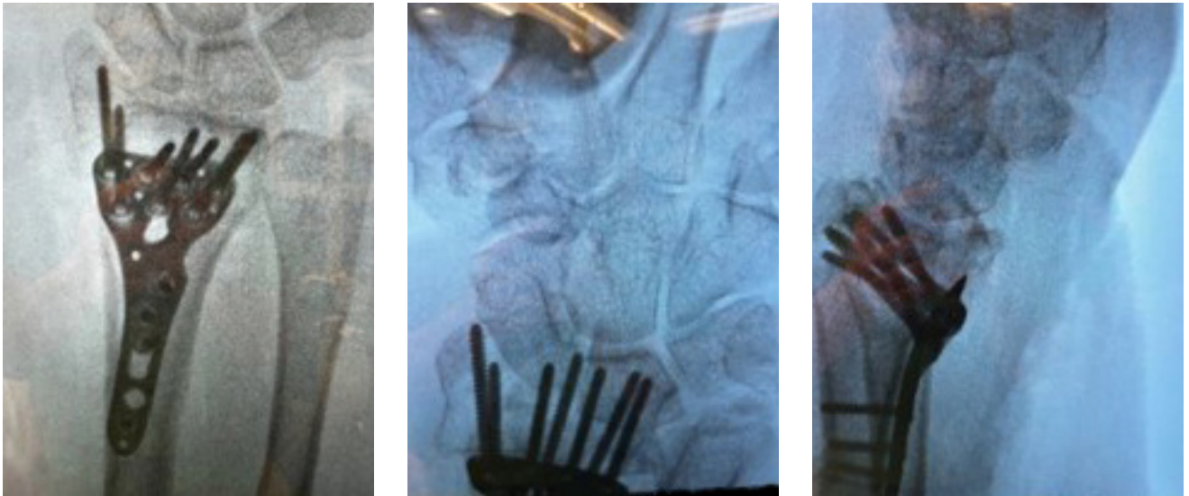
X-rays during surgery

In order to allow the patient to weight bear, it has been decided to proceed with the spanning plate as an additional form of fixation. Once the wrist was back to the normal alignment, a minimally invasive technique to approach the dorsal aspect of the hand and wrist has been used.