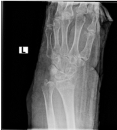
PA x-ray post injury